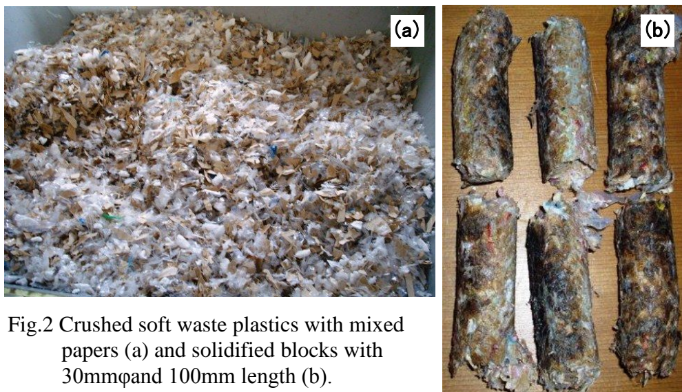
Fig.2 Crushed soft waste plastics with mixed papers (a) and solidified blocks with 30mm \phi and 100mm length (b).

The developed machine shown in Fig. 1 can solidify the soft waste plastics with papers mixed to the solidified blocks whose diameter is 30mm \phi and length is about 100mm called RPF (Refuse plastics and papers fuel). And this RPF is effective to use the alternative fuel of coal in the paper production works, etc. Fig. 2 shows the crushed materials and the produced RPF by use of the soft waste plastics with papers mixed.